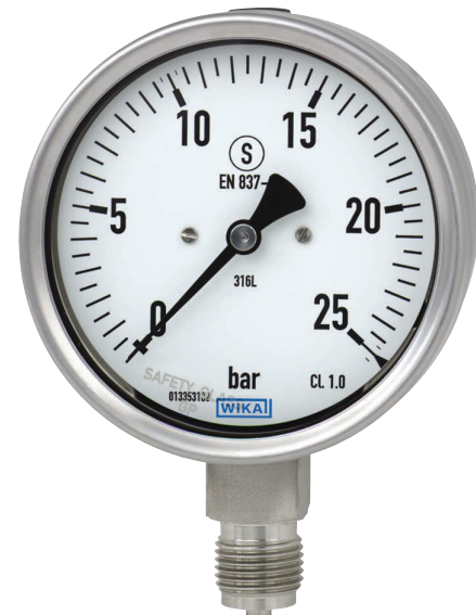
Bourdon tube pressure gauge model 232.30